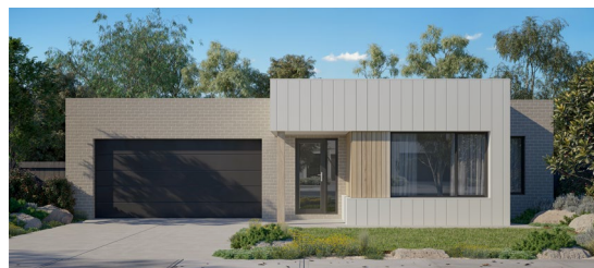
MODERN EDGE FACADE

All facades shown on The Murray 285 floorplan. Facade design varies for each home layout.