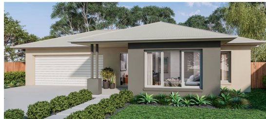
EVERYDAY HOME FACADE

Choose from a range of attractive facades to suit your own personal style; from classic to modern.