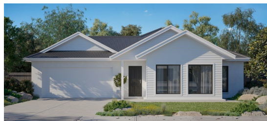
GRACEFUL GABLES FACADE