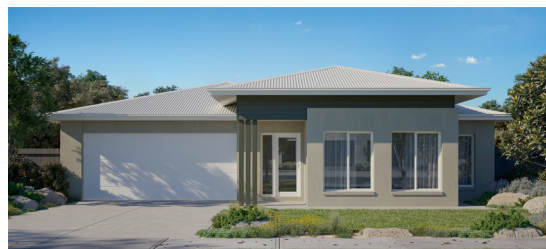
TIMELESS APPEAL FACADE