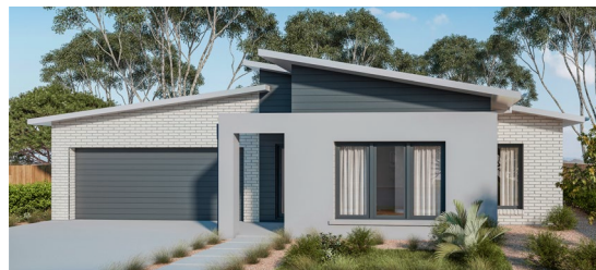
COASTAL INSPIRED FACADE