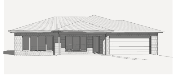
EVERYDAY HOME FACADE

Choose from two attractive facades to suit your own personal style; from classic to modern.