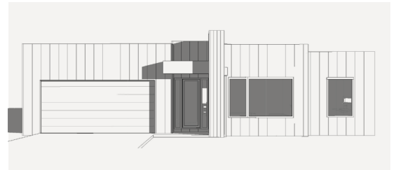
MODERN EDGE FACADE B

† Sizes may vary slightly per facade. ‡ Minimum lot sizes may vary due to estate guidelines and council requirements. Images, photographs and illustrations of our homes: a. may include certain items not included in the house price; such as landscaping, gardens, and fencing; b. are for illustrative use, not to scale and may depict dimensions, features or finishes which differ slightly to the facade as constructed. Note: All designs, plans and images are the property of Lane Housing Co Pty Ltd and must not be used, reproduced, copied or varied, wholly or in part without the written permission from an authorised representative of Lane Housing Co. Copyright Lane Housing Co Pty Ltd [ABN: 94 622 172 954 / CDB-U 52522]. We invite you to contact us at homes@lanehousingco.com.au or (03) 5406 9090, we would love to personally meet you and discuss our range of lifestyle designs, our RRP and our extensive list of quality inclusions.