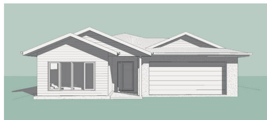
GRACEFUL GABLES FACADE