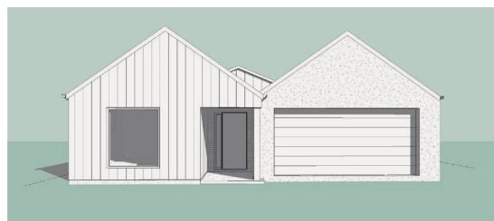
MODERN GABLES FACADE

All facades shown on The Noosa 332 house plan. Facade design varies for each home layout.