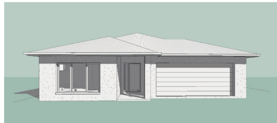
EVERYDAY HOME FACADE

Choose from a range of attractive facades to suit your own personal style; from classic to modern.