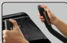
Resistance Level Control