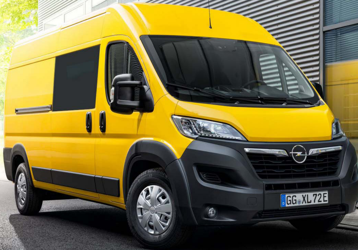
OPEL MOVANO Crew Cab