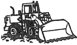
COMMERCIAL & RESIDENTIAL DEMOLITION

P.O. BOX 14668 OKLAHOMA CITY, OK 73113 OFFICE (405) 478-8833