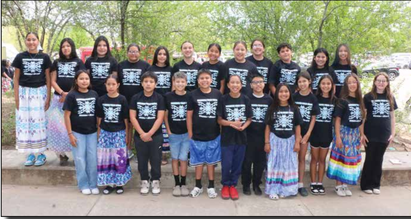
Darlington Public Schools perform an Arapaho Hymn and a Cheyenne Hymn in the 6th-8th grade extra large group category at the Oklahoma Native American Youth Language Fair.