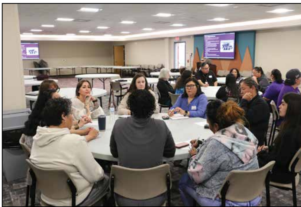
Break out groups lead discussions and network among one another during the connected circles summit.

“Following up with your guests, following up with your clients, following up with other partners has been a great thing, also just education on NARCAN and opioids and things like that is a great thing, what has been a great takeaway for me is just getting our staff more educated on those type of things,” Cole said.