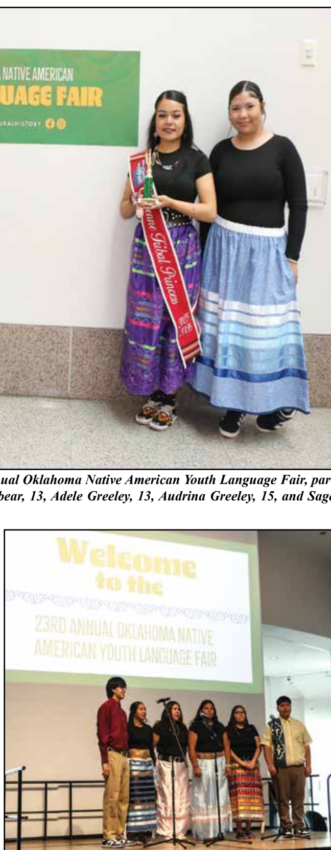
Cheyenne and Arapaho Youth from the Koinonia Indian Mennonite Church perform a Cheyenne Hymn.