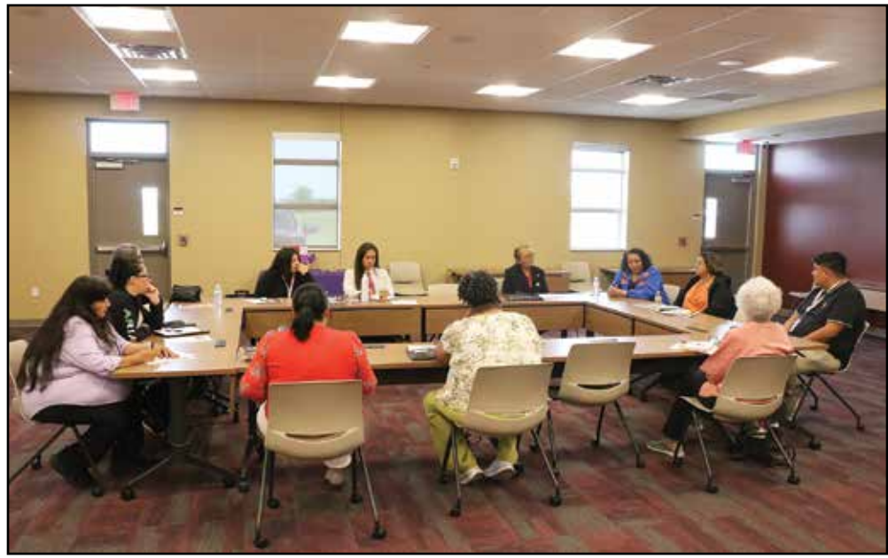
Forming in a circle for the meeting, each advocate and program representative introduced themselves and the program services they currently offer.

"I'm excited to be here and to learn and be able to provide that service to our Indian pop-