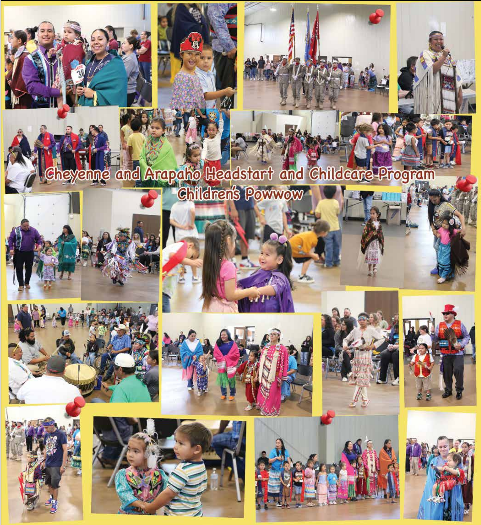
Cheyenne and Arapaho Headstart and Childcare Program Children's Powwow