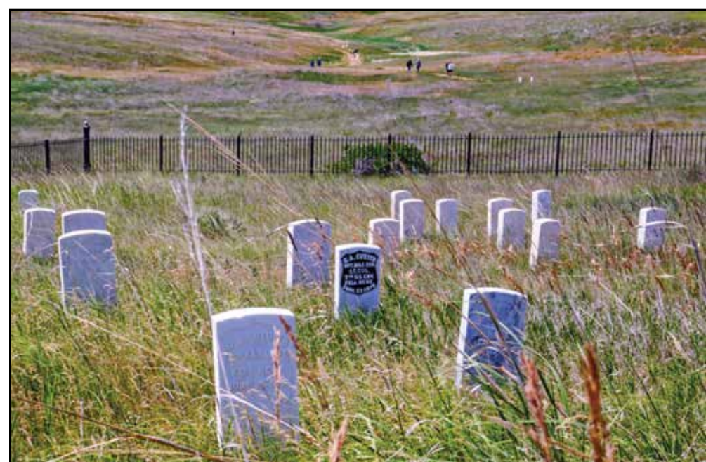
Burial markers at the site of the "Last Stand." Custer's is the only one with a black marking on the face.

Remembering Greasy Grass The Battle of the Little Bighorn fought June 25-26, 1876, remains one of the most