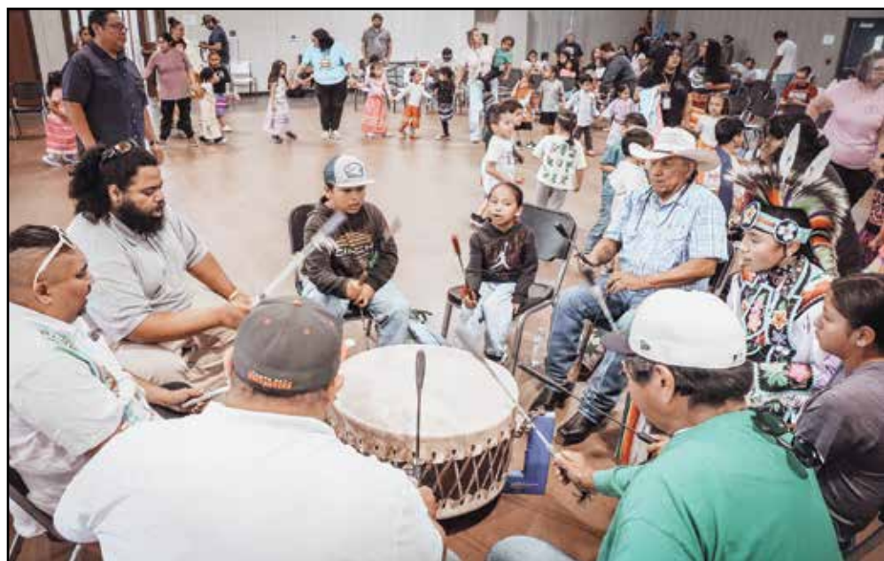
Tribal youth participate in the drum group and sing for the Children's Powwow through various traditional songs.