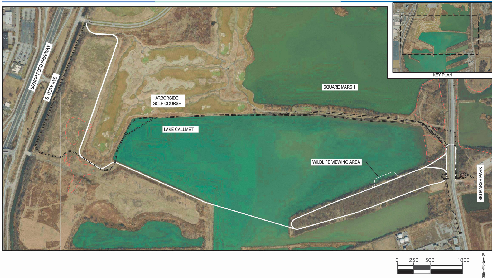
FIGURE 10-10: PREFERRED ALTERNATIVE