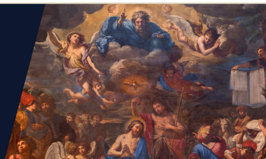
The Baptism of Christ, Elisabetta Sirani

Heavenly Father, just as you called your Son “beloved,” you also call me your own. Through the Holy Spirit, draw me closer to Jesus Christ, the true vine, so that I might abide in him and, in his holy light, see myself as you see me. We ask this through Jesus Christ. Amen.