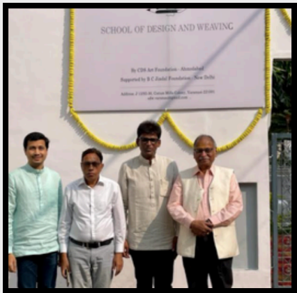
PEH continually collaborates with the School of Design and Weaving.