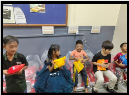
Children being helped in ARMAAN- the Center for Children with Disabilities.