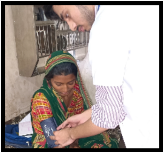
Medical services provided to everyone in the community.