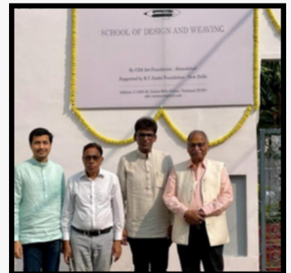
PEH continually collaborates with the School of Design and Weaving.