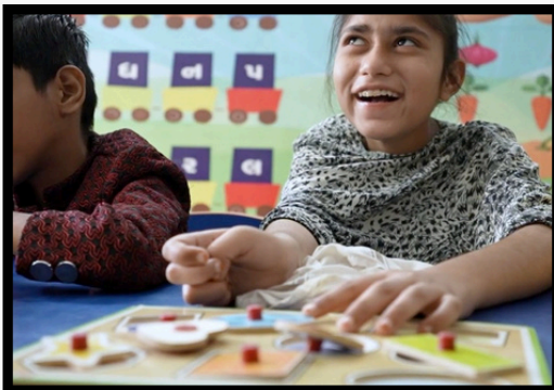
At ARMAAN, children receive the education, therapy, and care they need to thrive.