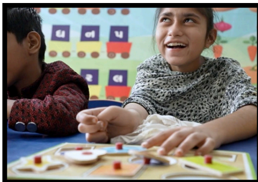
At ARMAAN, the Center for Children with Disabilities, children receive the education, therapy, and care they need to thrive.