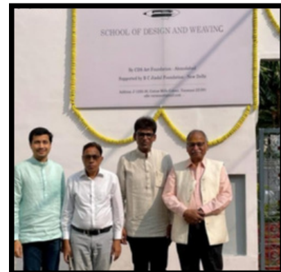
PEH continually collaborates with the School of Design and Weaving.