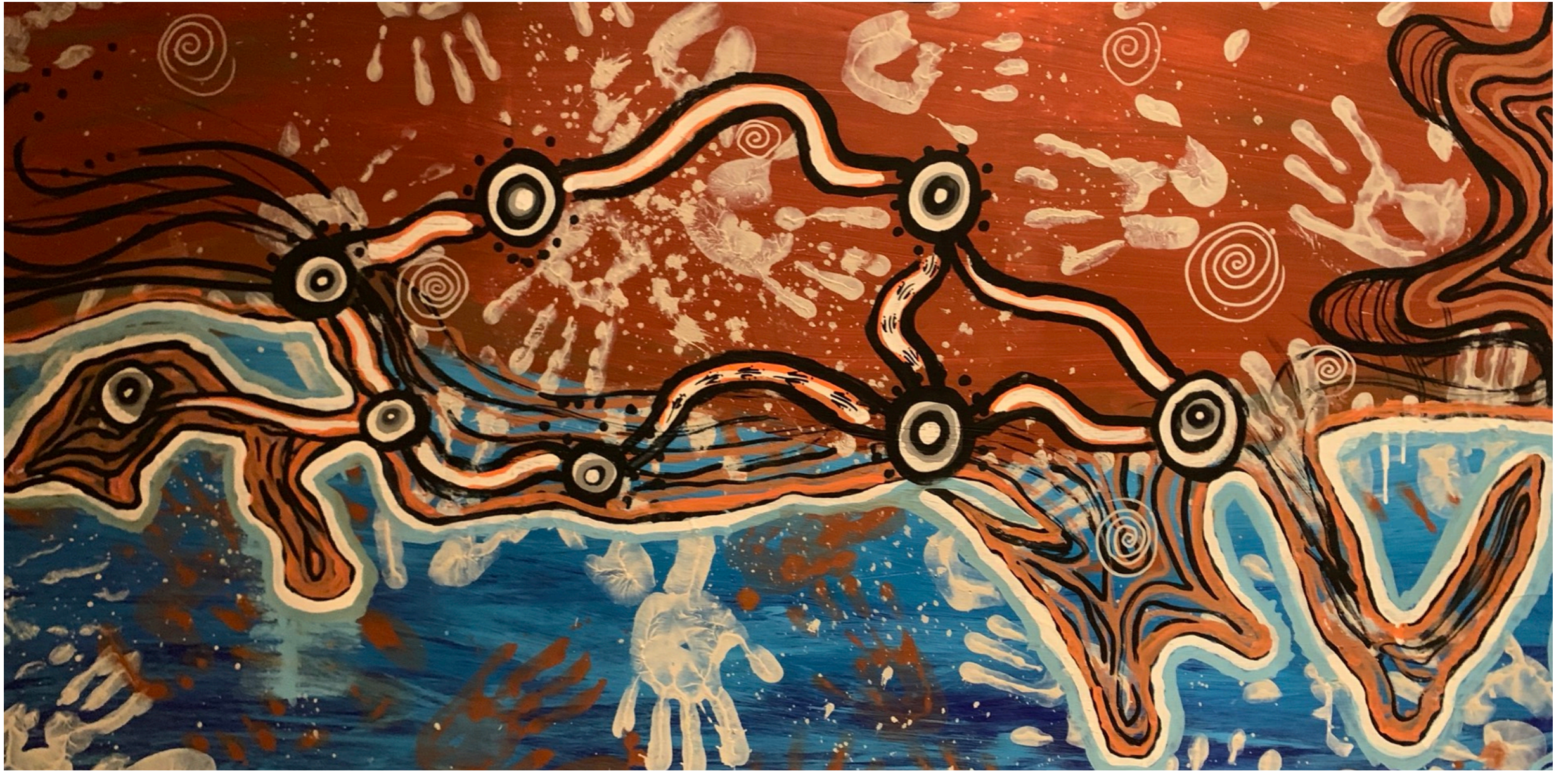
Tullagum Warmoon Warreeny (Bass River to Wilsons Prom ,Bass Coast Boonwurrung country and Ocean)