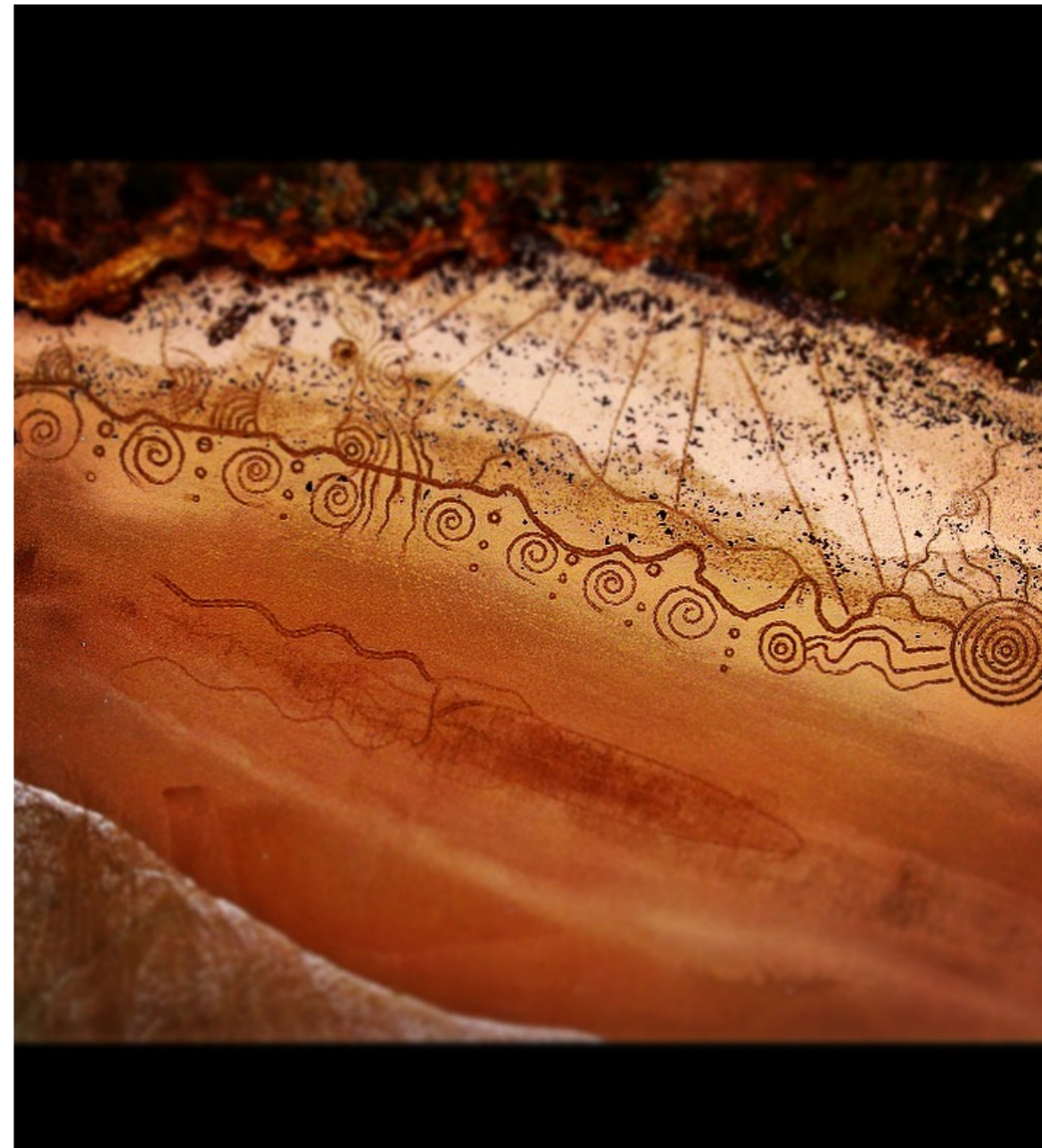
Sand Art design Sunderland Bay pic taken from drone.