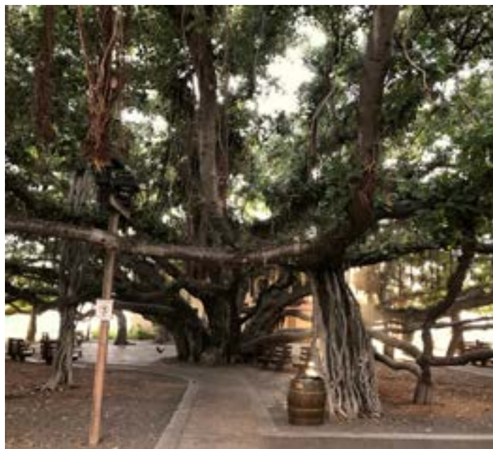
(Above) The banyan tree in Lahaina, Maui.