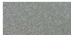
Charcoal - Exposed Sand *colors may vary, see actual pallets