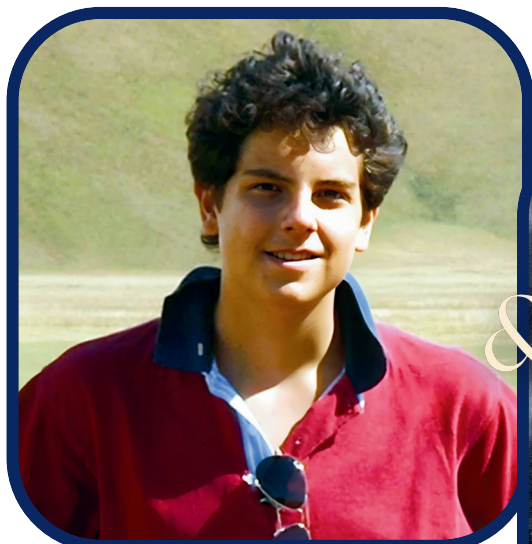
ST CARLO ACUTIS

“The Eucharist is my Highway to Heaven.”