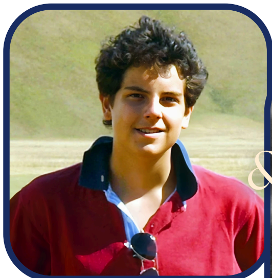
ST CARLO ACUTIS

“The Eucharist is my Highway to Heaven.”