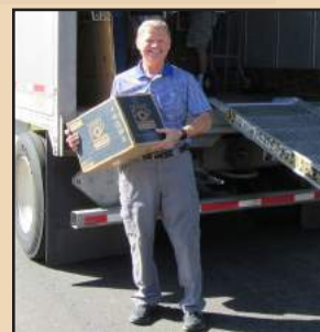
Moving into 67 Daniel