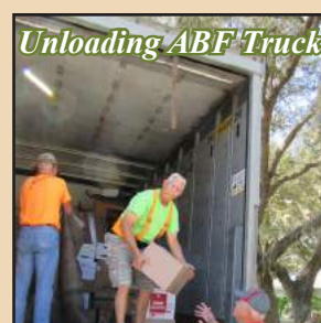
Unloading ABF Truck