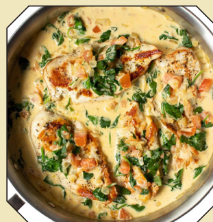
Maranatha Village Cookbook

In a large skillet add olive oil and cook the chicken on medium high heat for 3-5 minutes on each side or until brown on each side and cooked until no longer pink in center. Remove chicken and set aside on a plate.