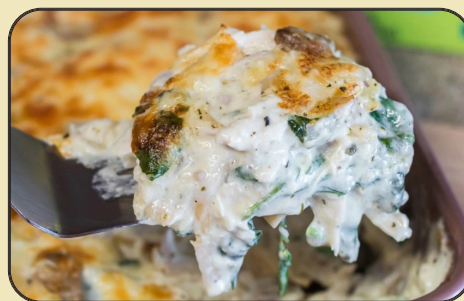
Maranatha Village Cookbook

Preheat oven to 350°. Sauté pepper, onion & butter. Cook noodles in a separate pan. Add soup and milk to the onion/butter. Heat through. Place thin layer of white sauce on bottom of a greased 9"x13" pan. Layer 3 noodles, sauce, ½ the chicken, ¼ c Parmesan cheese, 4 oz cheddar cheese and a small amount of sauce. Repeat this twice. Top with 3 noodles, sauce and 8 oz mozzarella cheese. Bake 350° for 45 minutes.