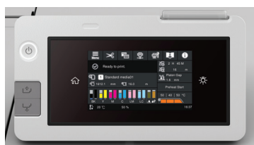
4.3" tiltable touchscreen