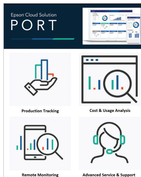
Epson Cloud Solution PORT

Epson is the registered trademark of Seiko Epson Corporation. All other names and company names used herein are for identification purpose only and are trademarks of their respective owners; Epson disclaims any and all rights. Specifications are subject to change without notice. Visit www.epson.com.au or www.epson.co.nz for the latest information.