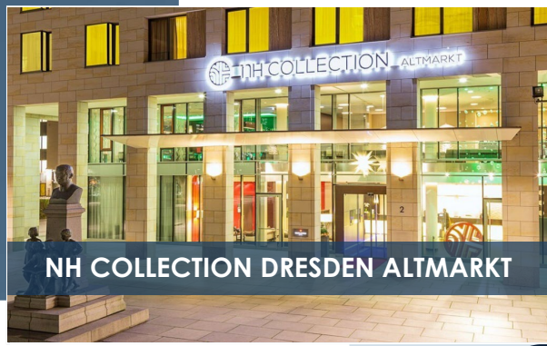
NH COLLECTION DRESDEN ALTMARKT