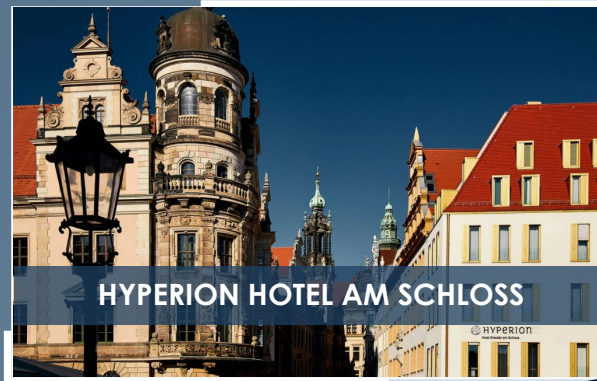
HYPERION HOTEL AM SCHLOSS