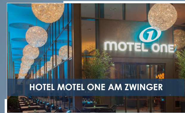
HOTEL MOTEL ONE AM ZWINGER