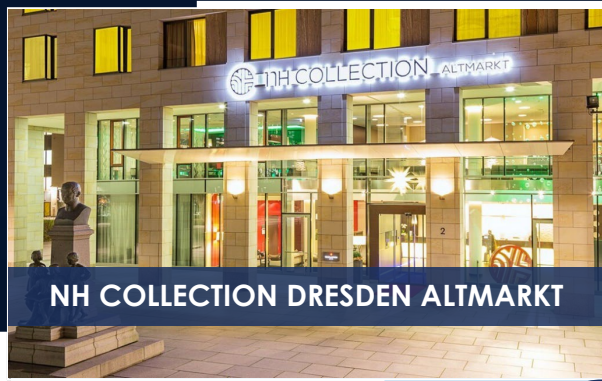
NH COLLECTION DRESDEN ALTMARKT