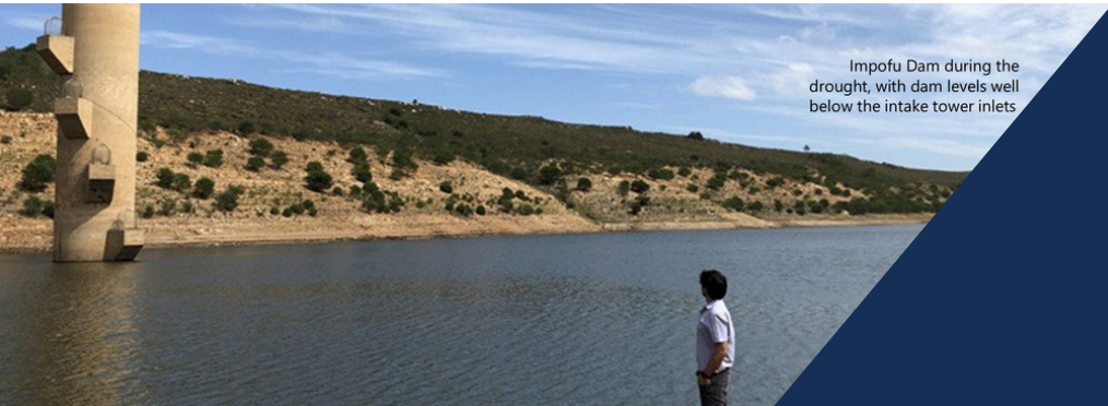
Impofu Dam during the drought, with dam levels well below the intake tower inlets