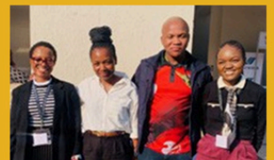
Opening day of the National Youth Indaba – Youth as Catalysts in Achieving SDG 6