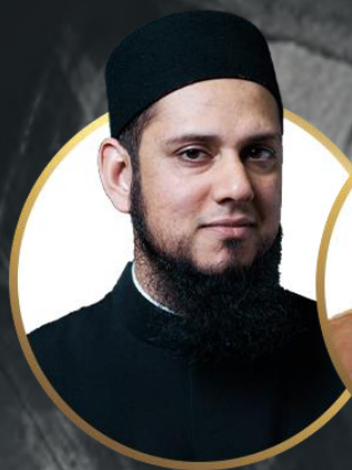
MUFTI AASIM RASHID