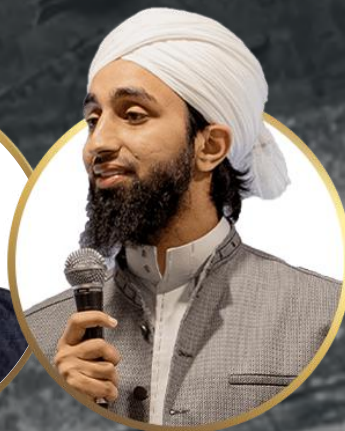
MUFTI ABDUL WAHAB WAHEED