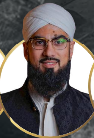
SHAYKH OOSMAN MUSTOOFA