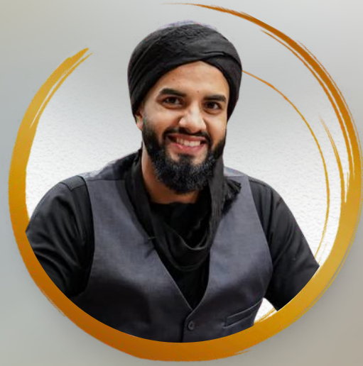
Mufti Sultan Mohiuddin