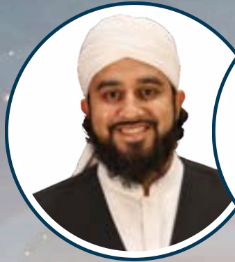
SHAYKH ABDULLAH WAHEED