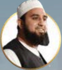
SHAYKH ABDULLAH WAHEED