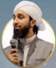
MUFTI ABDUL WAHAB WAHEED