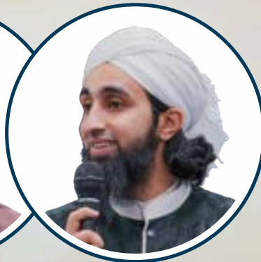
MUFTI ABDUL WAHAB WAHEED