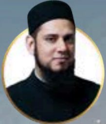
MUFTI AASIM RASHID