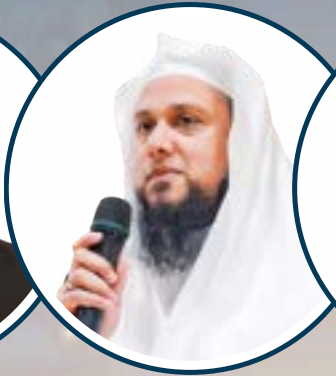
MUFTI AASIM RASHID