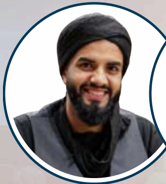
MUFTI SULTAN MOHIUDDIN