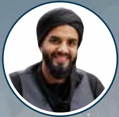
MUFTI SULTAN MOHIUDDIN