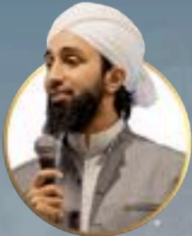
MUFTI ABDUL WAHAB WAHEED