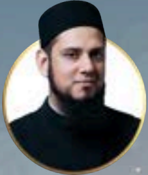
MUFTI AASIM RASHID