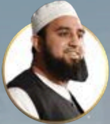
SHAYKH ABDULLAH WAHEED