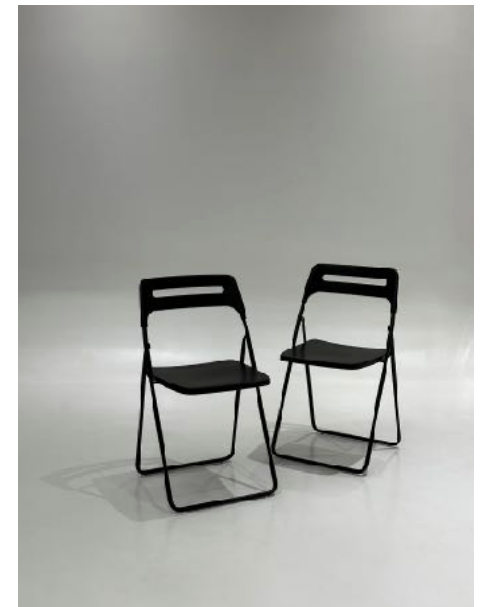
2 x Black Chairs