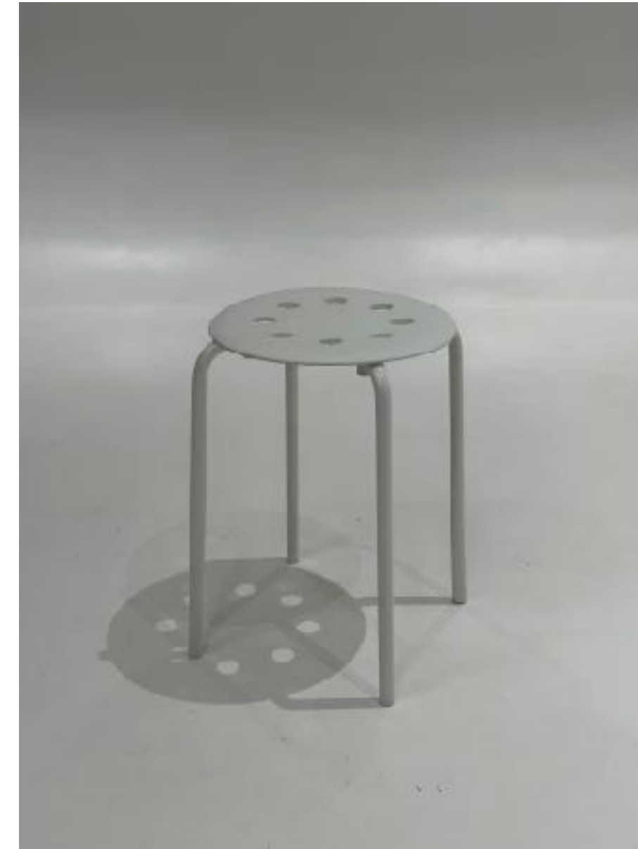
1 x White Stool