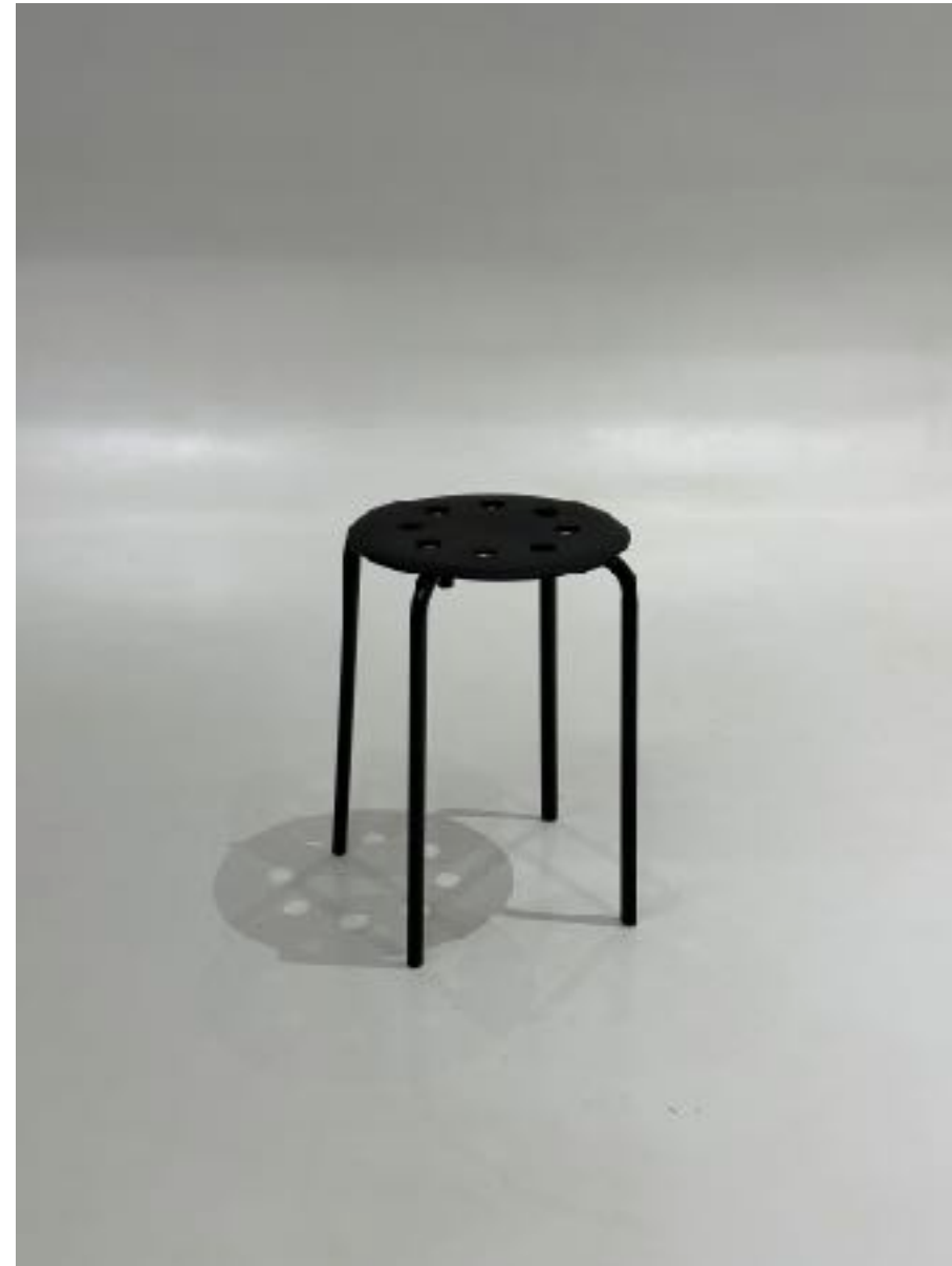
1 x Black Stool