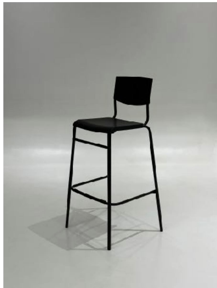
1 x Tall Black Chair