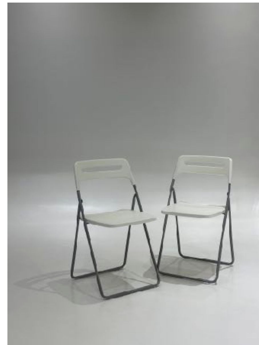
2 x White Chairs