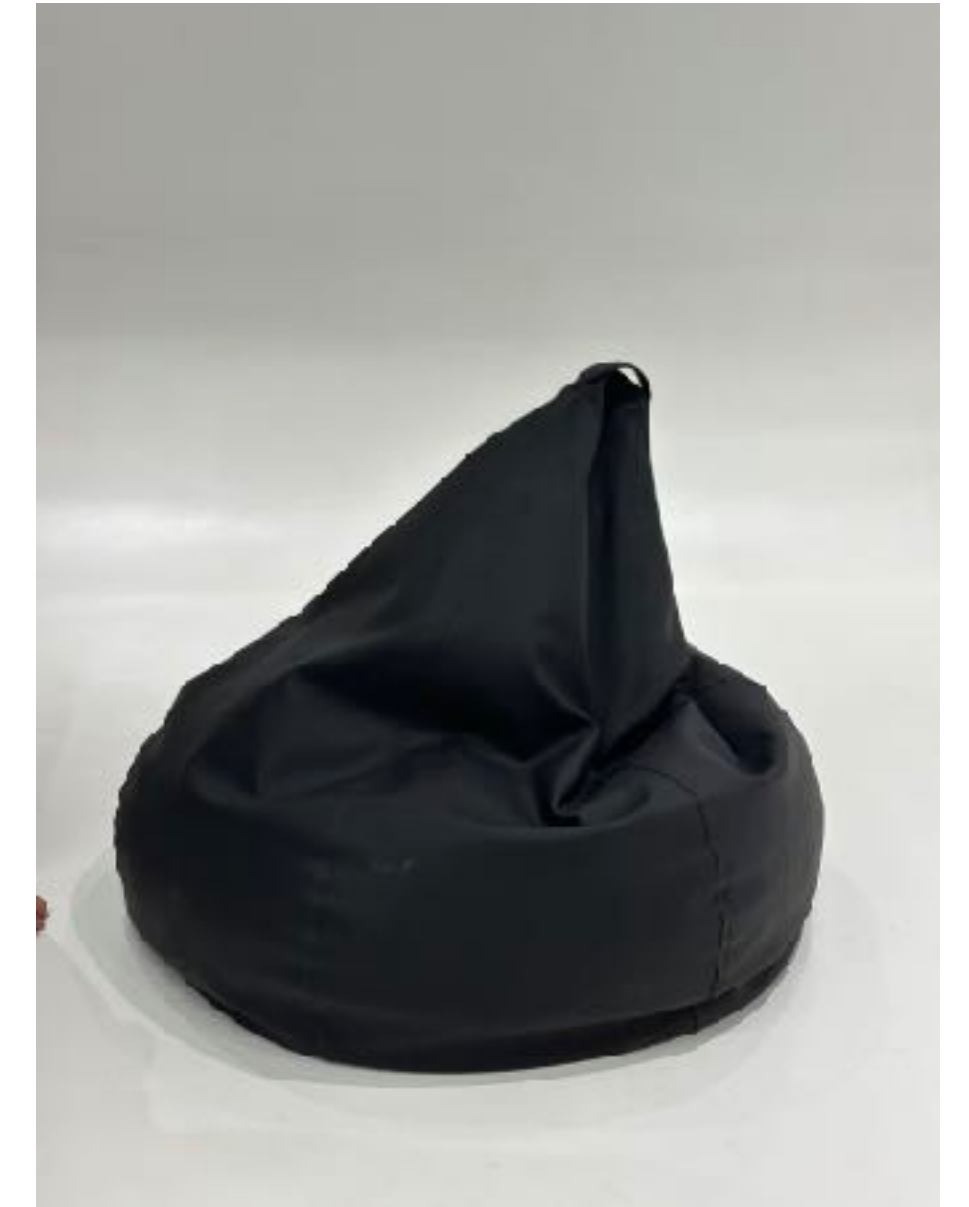
1 x Bean Bag