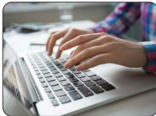
The Community Adult Learning Program is funded by Alberta Advanced Education.