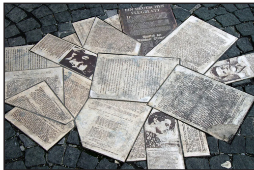
White Rose leaflets, White Rose Memorial, Munich, Germany

The White Rose organization, including brother and sister Hans and Sophie Scholl, felt compelled to protest the frightening environment in which they lived and studied. Their protests took the form of essays published in leaflets that were distributed anonymously in Munich, and then later mailed to persons selected from the phone book. These essays challenged citizens to resist the Nazi policies and encouraged non-violent political dissent. The White Rose members knew that to be silent in the face of evil was to surrender to it, encourage it, and enable it to grow stronger. Thus, their movement united others to resist Nazi tyranny by striving to eradicate the “face of evil” before it destroyed more innocent lives. According to an exhibit on display at the U.S. Holocaust Memorial Museum in Washington, D.C., “Of all the groups in Germany that opposed Hitler’s dictatorship, only one, code-named ‘White Rose’, openly protested the Nazi genocide against the Jews.”