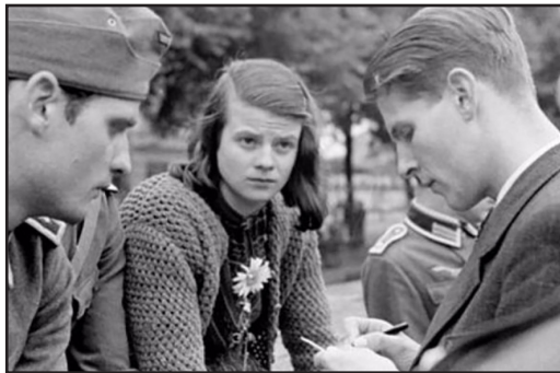
White Rose founders Hans and Sophie Scholl