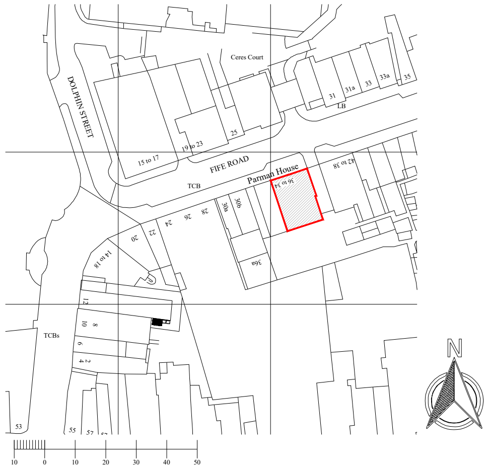
Site Location Plan Scale: 1:1250 @A3