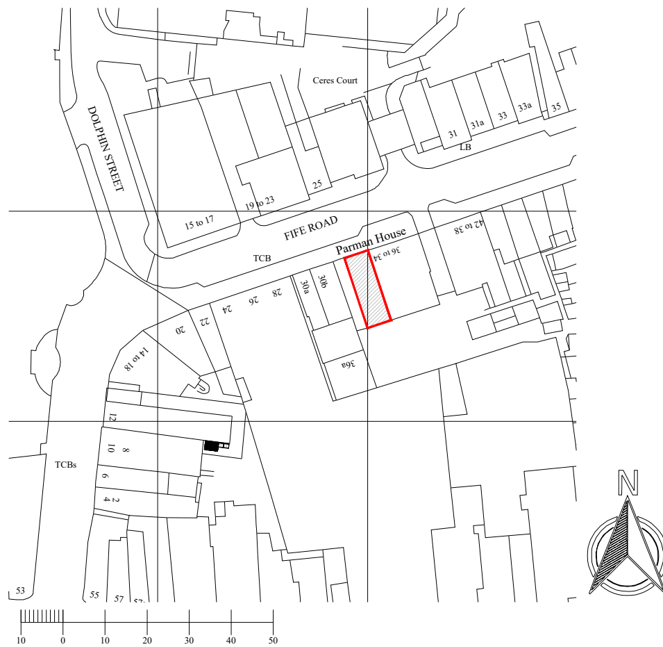
Site Location Plan Scale: 1:1250 @A3