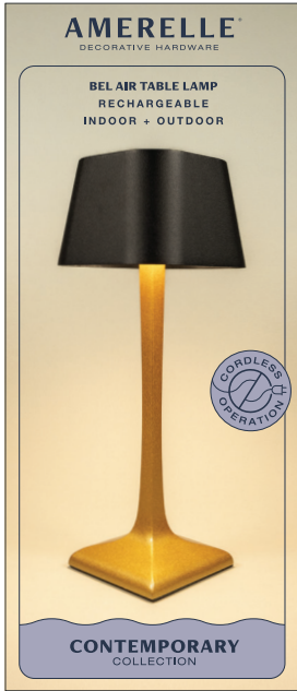
MATTE BLACK CHAMPAGNE BRONZE BL-3BELA-MBCB

VISIT AMERELLEWALLPLATES.COM FOR MORE INFORMATION