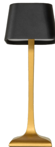
MATTE BLACK CHAMPAGNE BRONZE