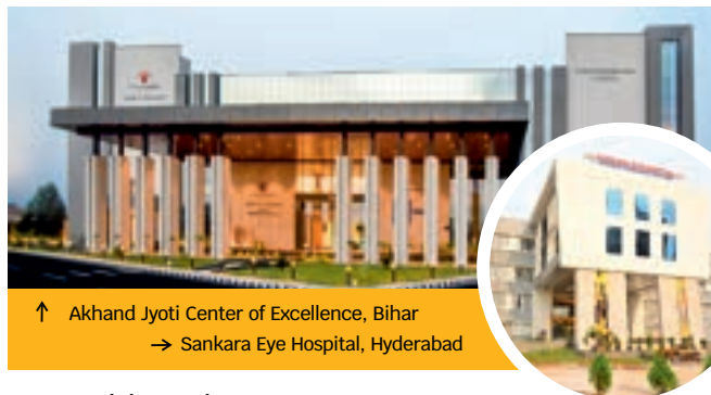
↑ Akhand Jyoti Center of Excellence, Bihar → Sankara Eye Hospital, Hyderabad