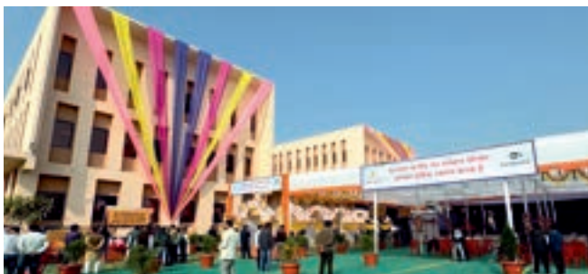
Kalyanam Karoti Eye Institute, Mathura

Our March to a Million goal is to provide One Million Free Eye Surgeries annually to the underserved in India by 2030.