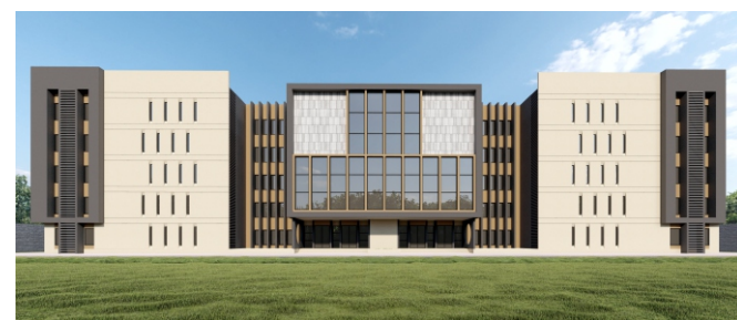
Akhand Jyoti - Rajiv Latika Jain Campus, Mastichak, Bihar

Akhand Jyoti - Rajiv Latika Jain Campus, Mastichak, Bihar - Mega Project (Annual free eye surgery capacity: 230,000)