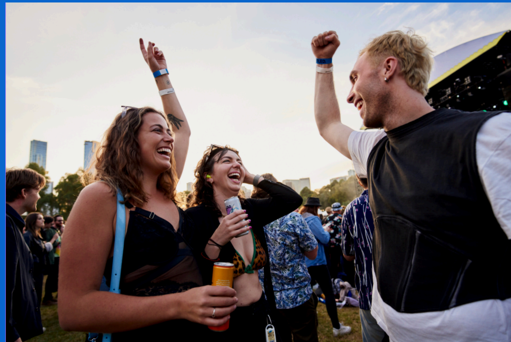
[Festival patrons laughing and dancing together]

I can enjoy the festival in the way that feels best for me.