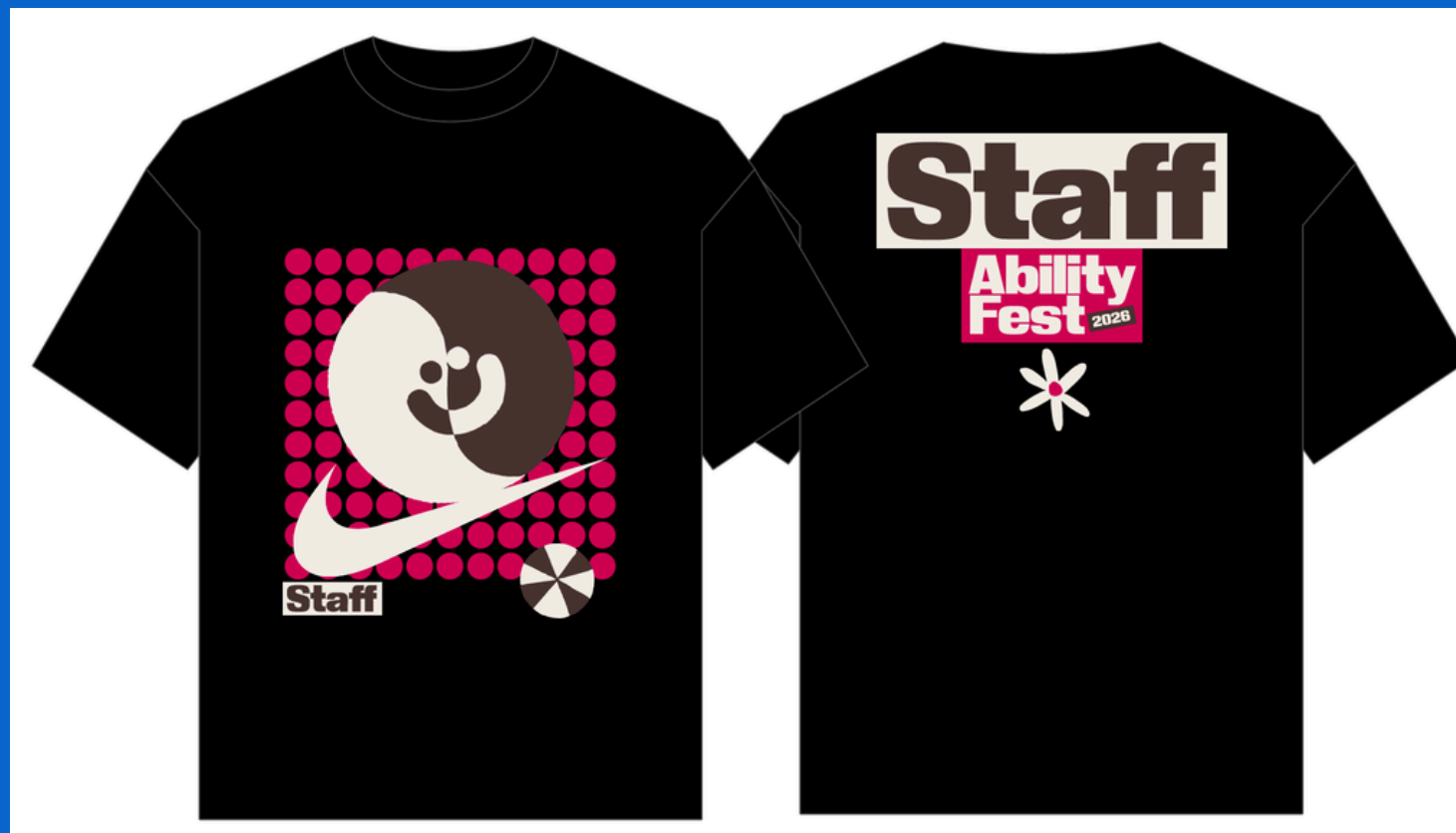
[T-shirts that staff will be wearing at Ability Fest]

If I need help, I can ask one of the friendly people wearing a shirt that says STAFF or VOLUNTEER on the back.