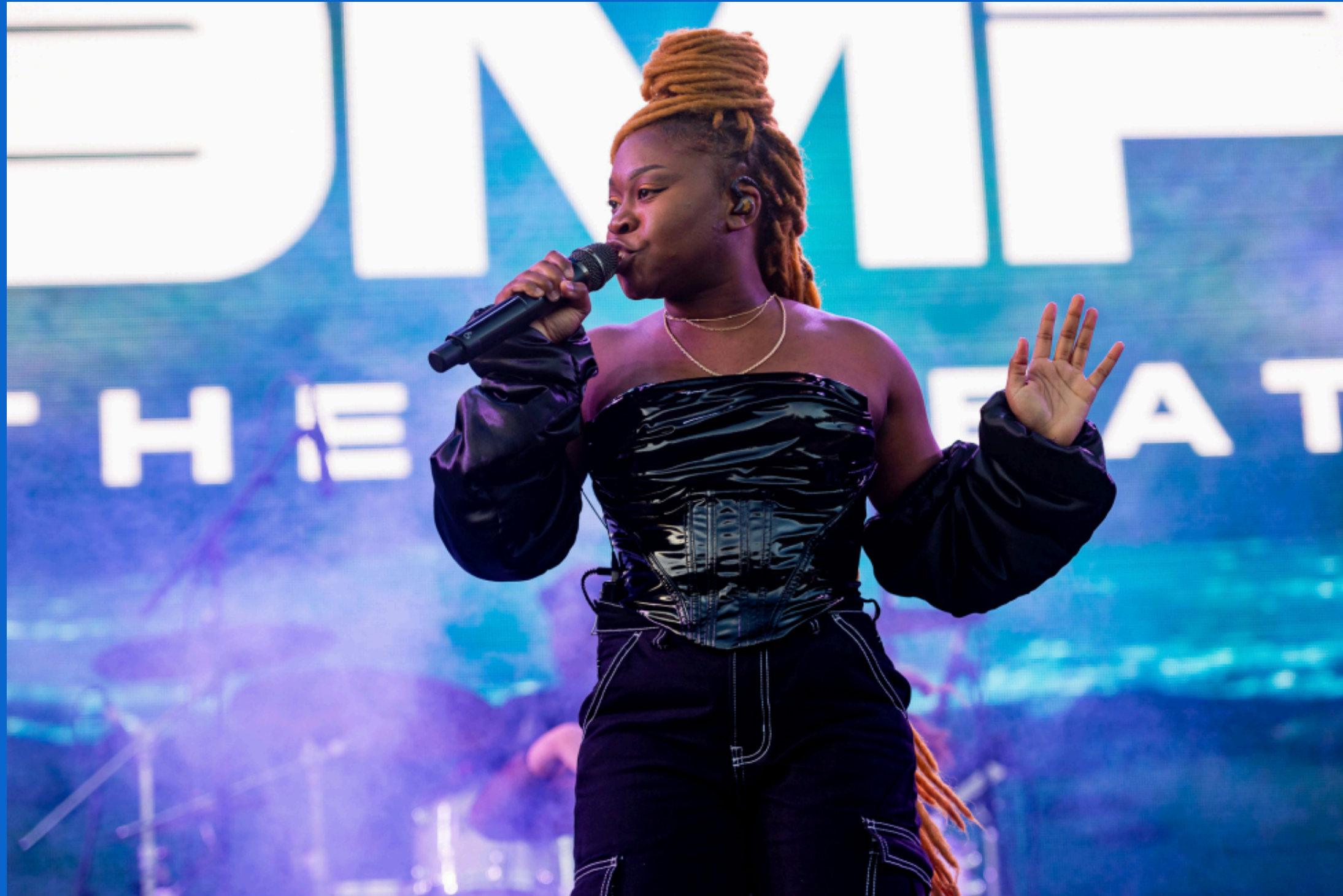
[Musician singing on stage at Ability Fest]