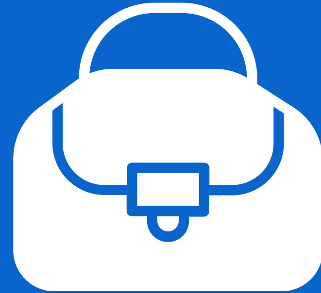
Bag (smaller than A4)