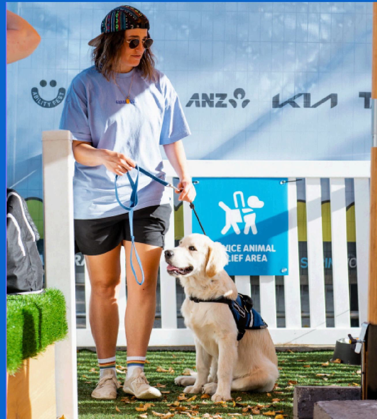
Patron stands with their guide dog in the dog respite area at Ability Fest]

It is important to remember not to touch these dogs.