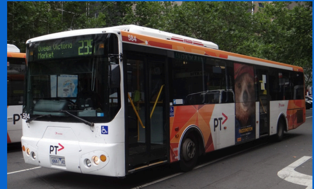
[Bus going route 235]

I will then see the entrance to Ability Fest.