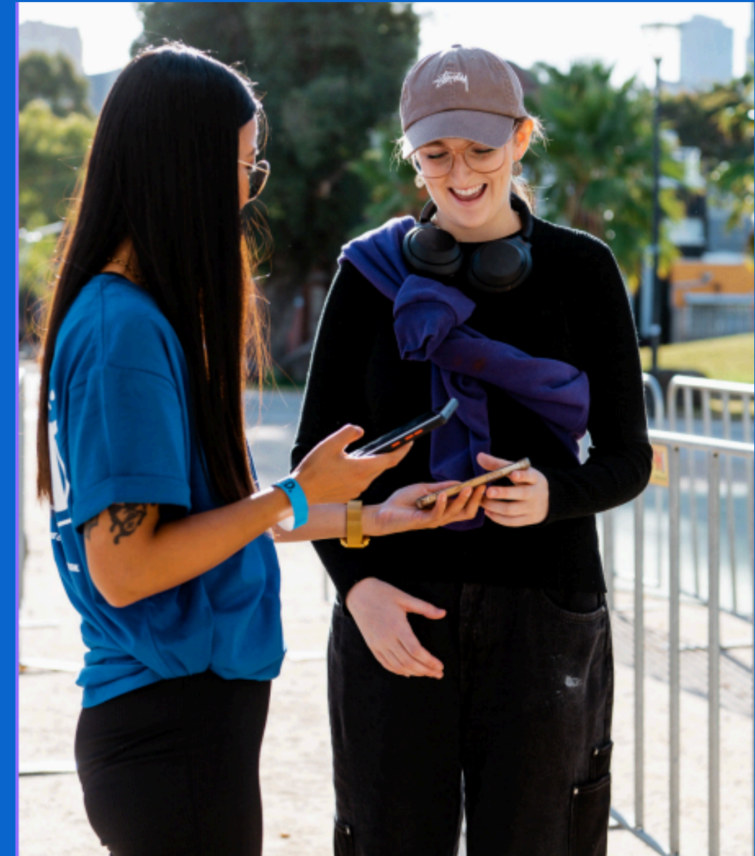
[At the festival entrance, a staff member is scanning the ticket on a patron's phone]