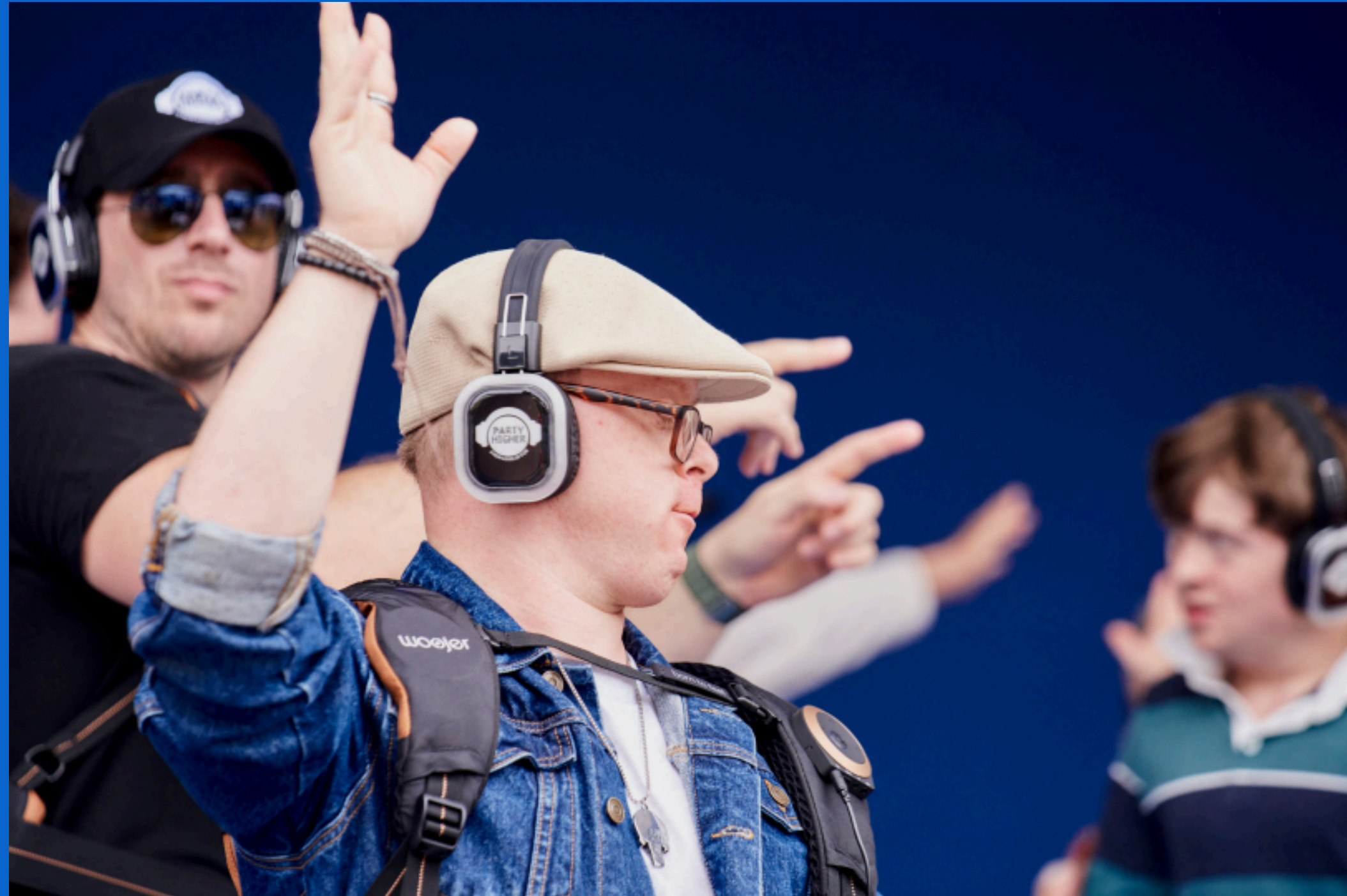
[Patron at the Silent Disco wearing headphones and a haptic vest]