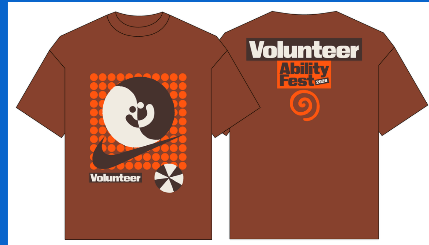
[T-shirts that volunteers will be wearing at Ability Fest]