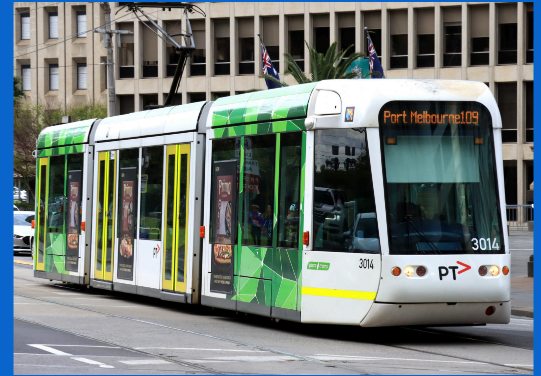
[Tram 109 to Port Melbourne]