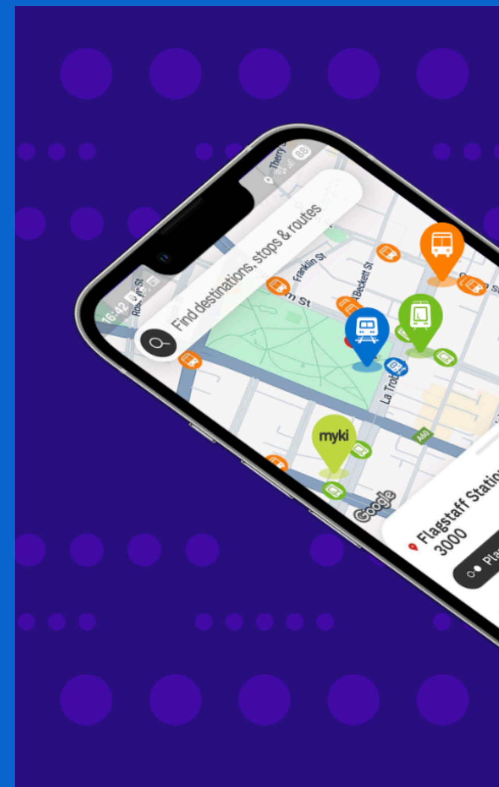
[Phone depicts PTV Journey Planner App]

Before I travel, I can use the Transport Victoria Journey Planner to plan how I will get to Ability Fest.