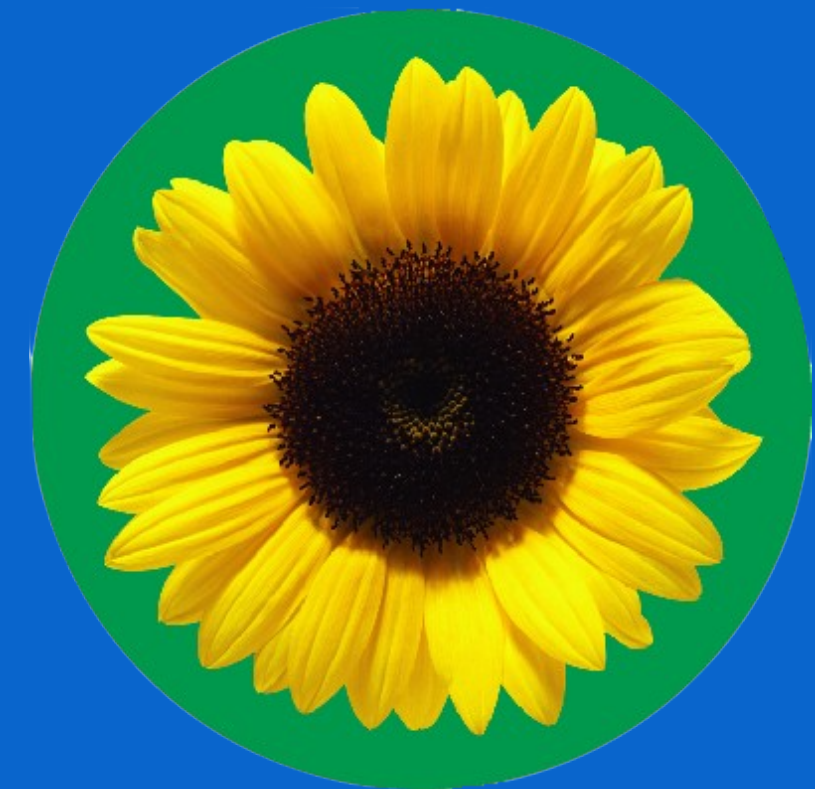
[Hidden Disability Sunflower Logo]

This lets people know I may need extra help today.