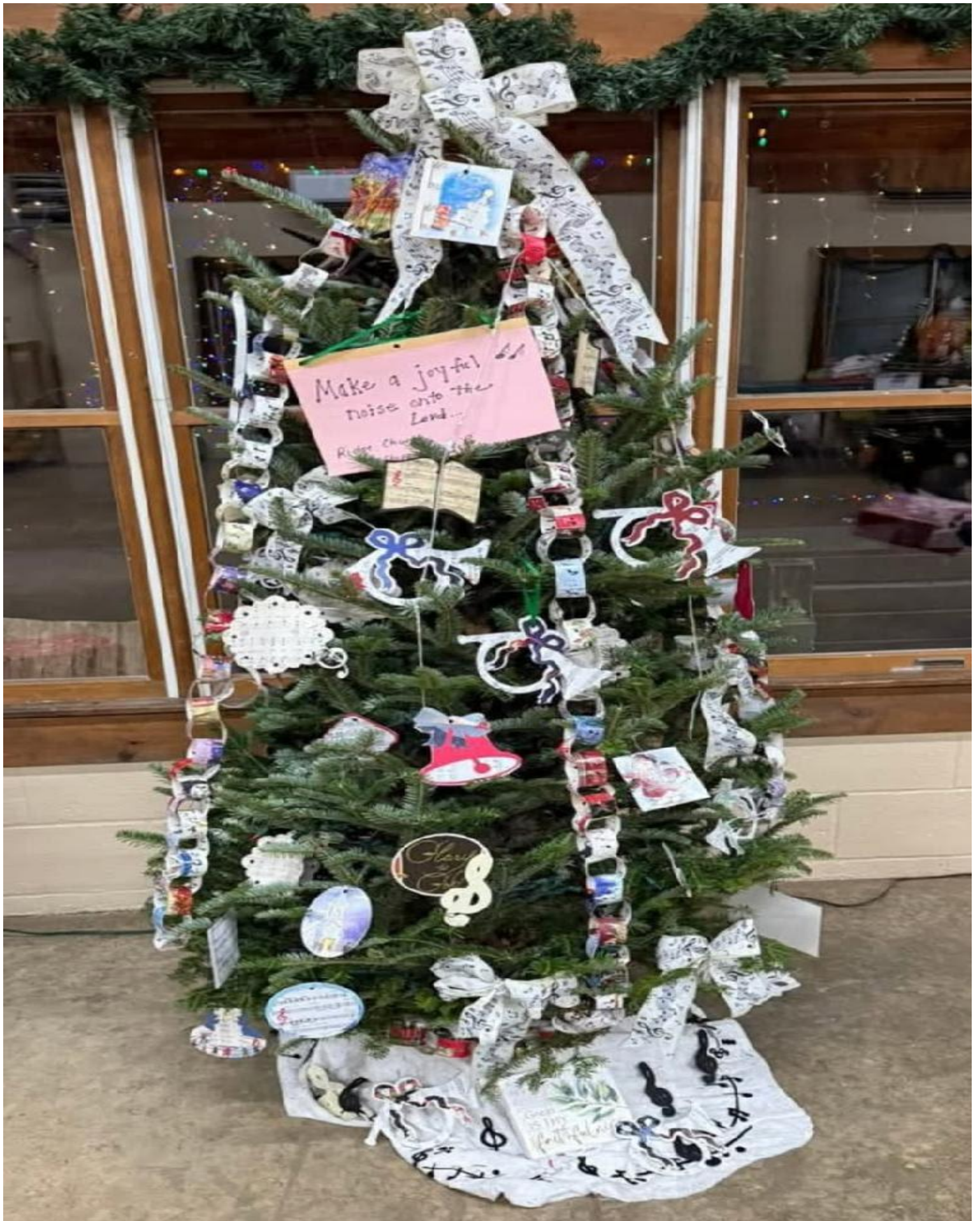
Camp Eder Christmas Tree Festival 2025 – Ridge Church Tree