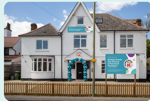
Example building frontage with parking