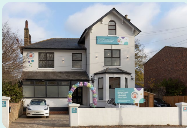
Example of building frontage with parking