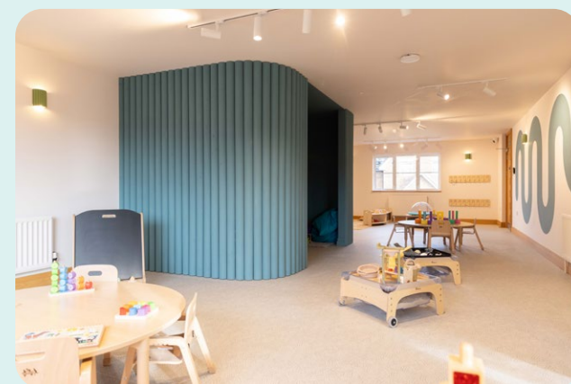
Example of internal space