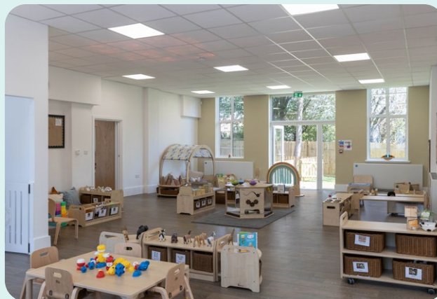
Example of internal space