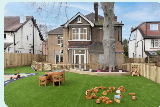
Example of outdoor space