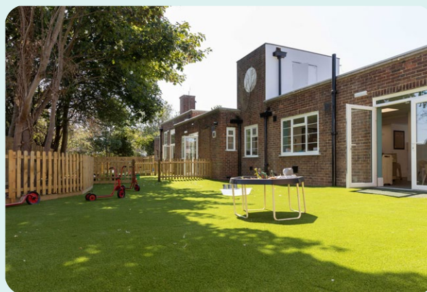
Example of outdoor space