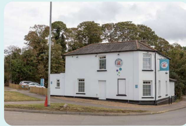
Example building frontage with parking