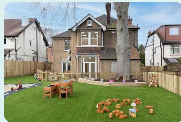
Example of outdoor space