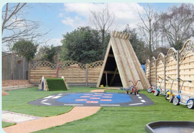
Example of outdoor space