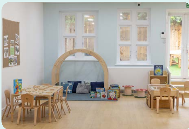
Example of internal space