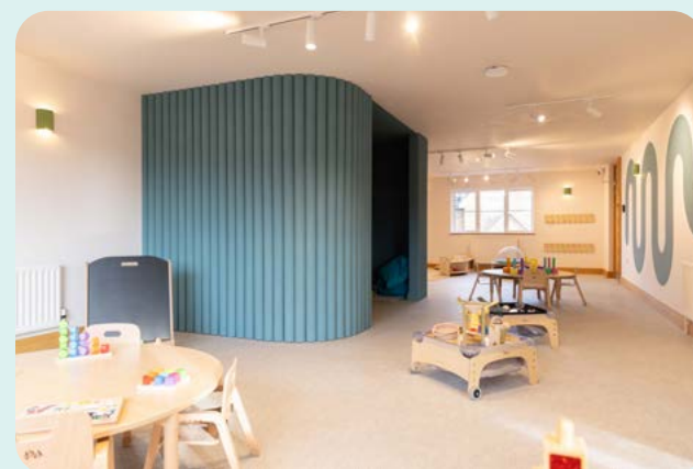
Example of internal space