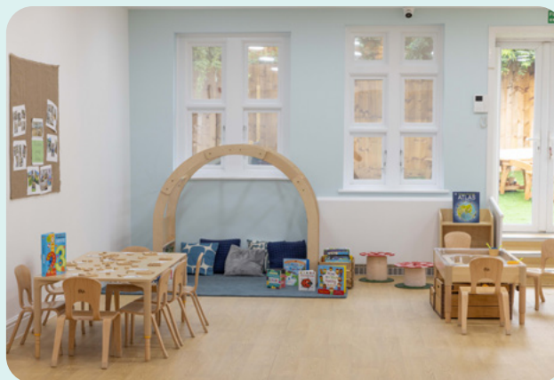
Example of internal space