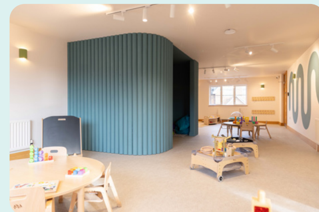
Example of internal space