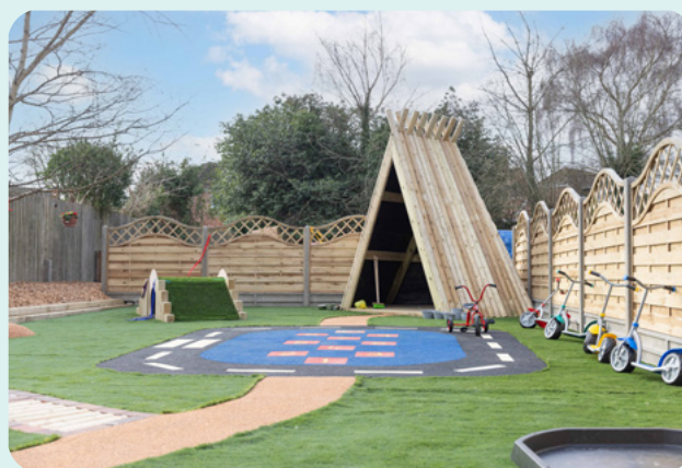
Example of outdoor space