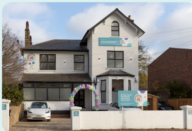
Example of building frontage with parking