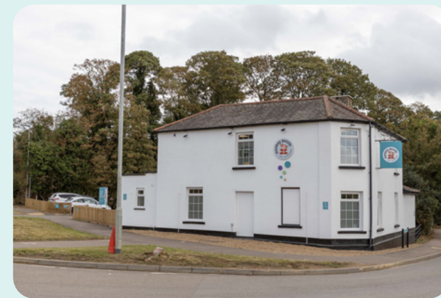
Example building frontage with parking