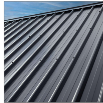
Metal Roofing - Trapezoidal profile