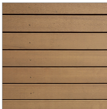
Natural cladding -Selected Horizontal Cedar w/board cladding