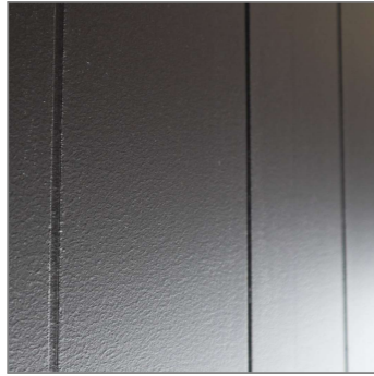
Panel cladding -INNOVA Duragroove panel cladding -Smooth extra wide (400)