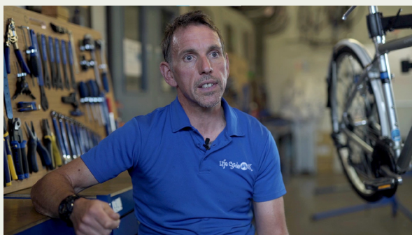
Bikes beyond bars

Take a look at our videos to learn about our projects!