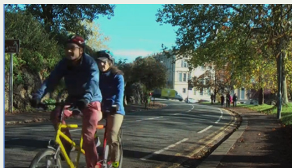
Tandem cycling for the visually impaired "Two's Company"