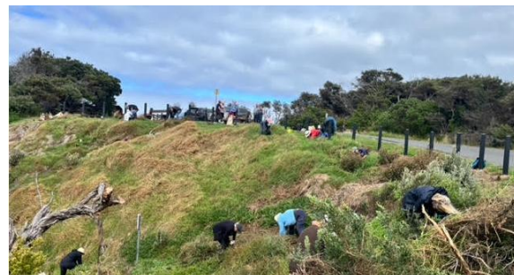
Hard at work at the top of the Boat Ramp