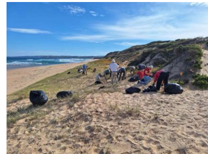
Volunteers removing the dreaded sea spurge