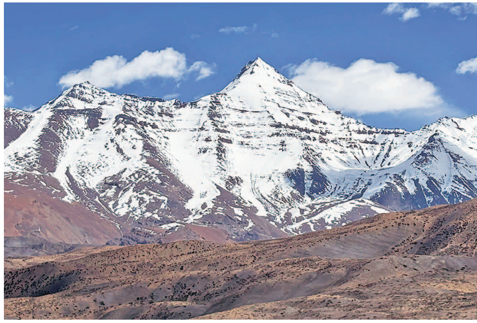
(Clockwise from far left) Dhankar monastery, Spiti; snow-capped peaks near Komic monastery; Kinner Kailash seen through prayer flags at Sangla Kanda

Unlike Spiti, this is lush green country with the snow mountains towering over the valley. But I could not find the forest of Bhojpatra trees that had fascinated me on my first trip to Sangla. Only an occasional specimen appeared among the cedars and maple trees.