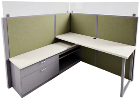
Configuration #4: L-Shaped workstation with frameless glass stackers, O-leg, & low profile storage.