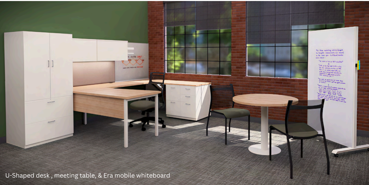
U-Shaped desk , meeting table, & Era mobile whiteboard

More than a panel system—Era seamlessly integrates with other gen2 products. Use panels as freestanding or mobile dividers for dynamic space division, or incorporate them into the innovative Wall system. With countless design combinations, Era adapts to every workspace need.