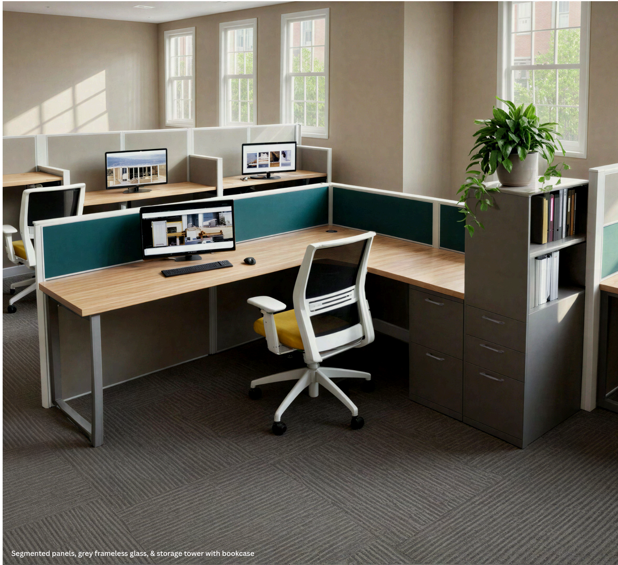
Segmented panels, grey frameless glass, & storage tower with bookcase