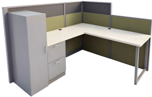
Configuration #3: L-Shaped workstation with O-Leg & wardrobe