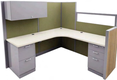
Configuration #5: L-Shaped workstation with overhead bin & fabric, laminate, & glass skins.