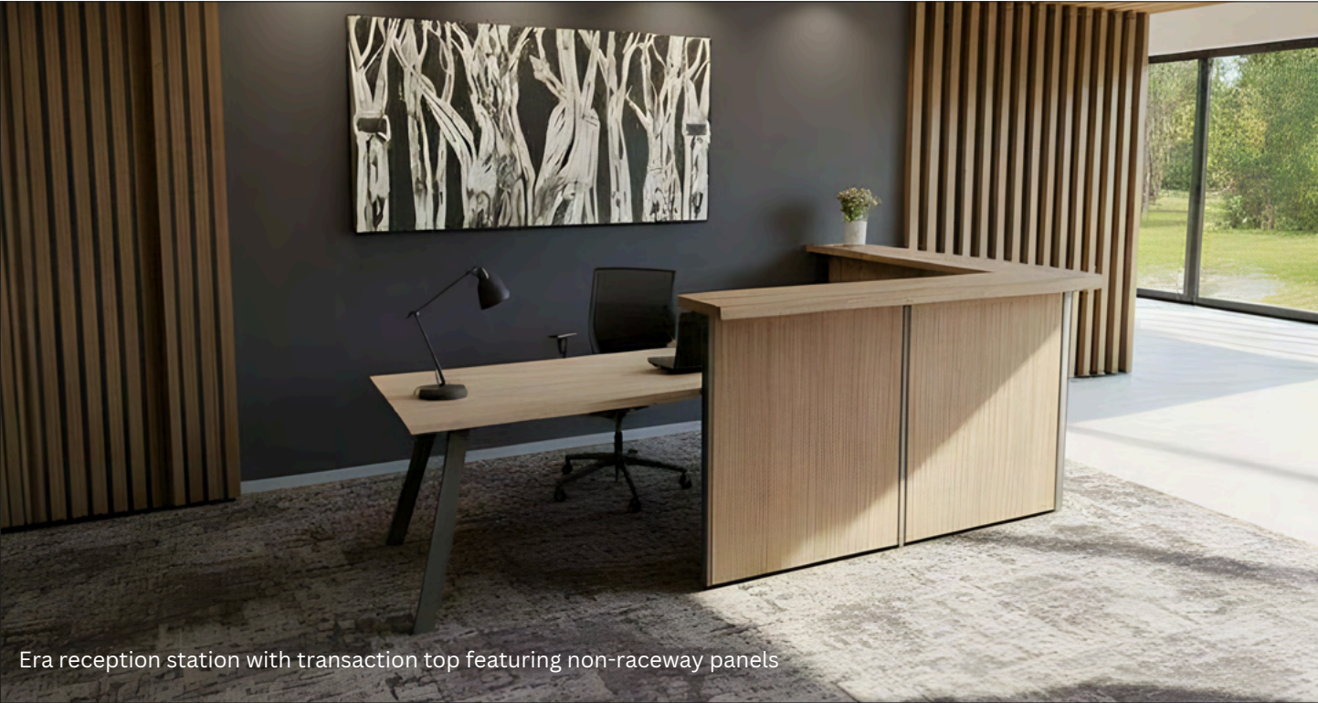
Era reception station with transaction top featuring non-raceway panels