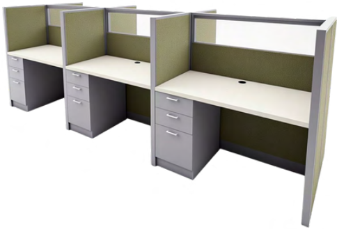
Configuration #6: 6-pack of straight desk workstations with fabric & glass skins