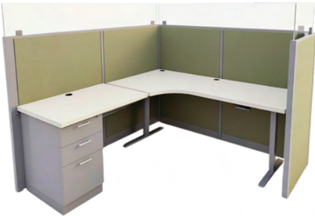
Configuration #2: L-Shaped workstation with frameless glass stackers & UP desk