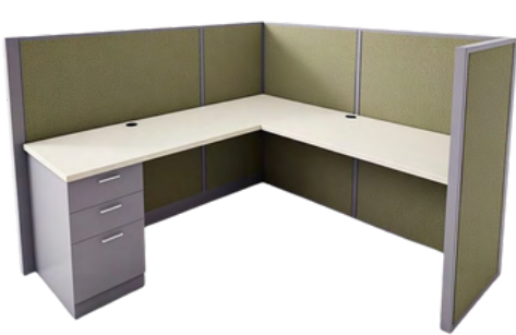
Configuration #1: L-Shaped workstation with fabric skins