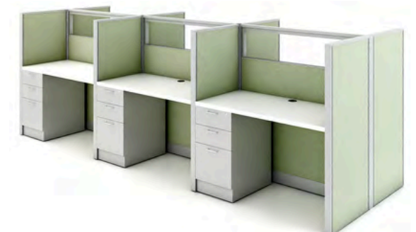
Configuration #6: 6-pack of straight desk workstations with fabric & glass skins