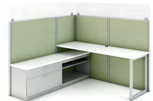
Configuration #4: L-Shaped workstation with frameless glass stackers, O-leg, & low profile storage.