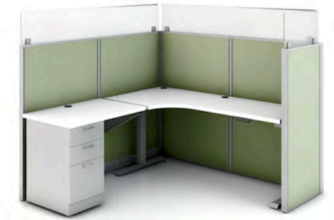
Configuration #2: L-Shaped workstation with frameless glass stackers & UP desk