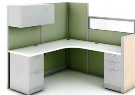
Configuration #5: L-Shaped workstation with overhead bin & fabric, laminate, & glass skins.