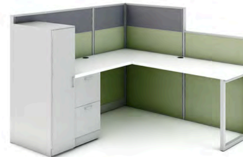
Configuration #3: L-Shaped workstation with O-Leg & wardrobe