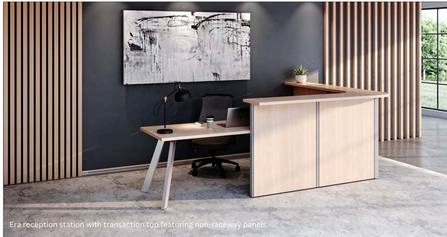
Era reception station with transaction top featuring non-raceway panels