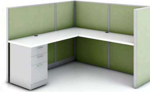
Configuration #1: L-Shaped workstation with fabric skins