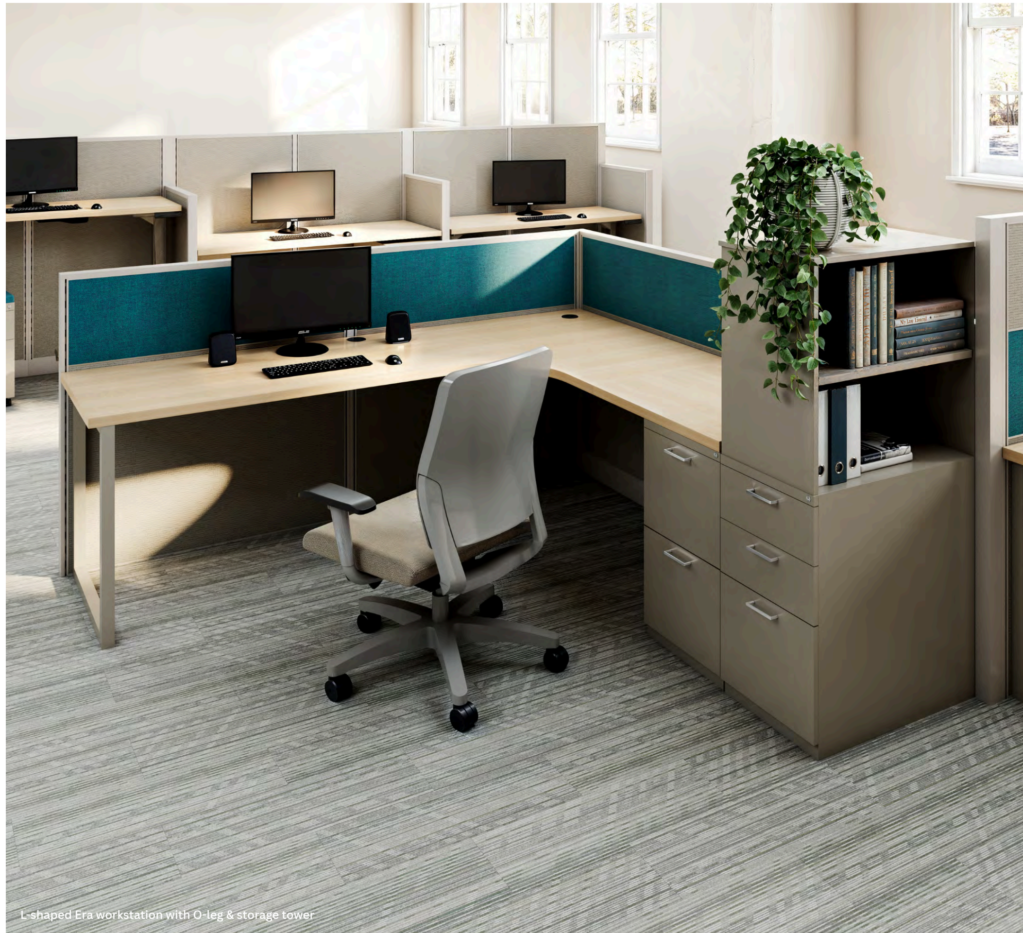
L-shaped Era workstation with O-leg & storage tower