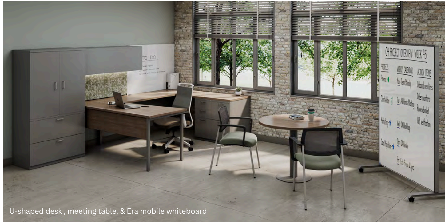
U-shaped desk , meeting table, & Era mobile whiteboard

More than a panel system—Era seamlessly integrates with other gen2 products. Use panels as freestanding or mobile dividers for dynamic space division, or incorporate them into the innovative Wall system. With countless design combinations, Era adapts to every workspace need.