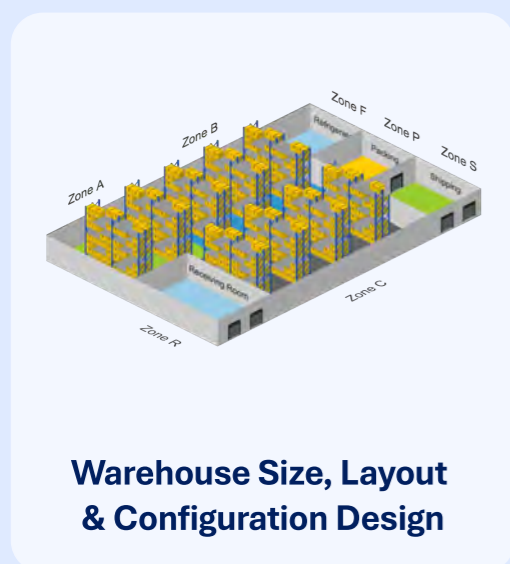
Warehouse Size, Layout & Configuration Design