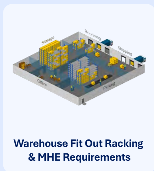
Warehouse Fit Out Racking & MHE Requirements