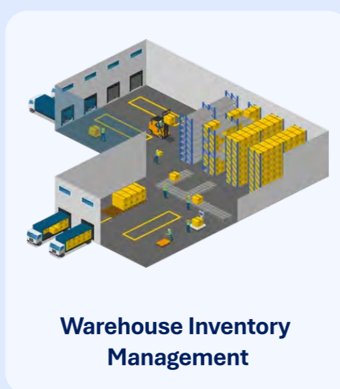
Warehouse Inventory Management