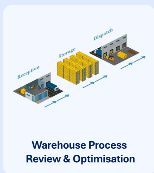
Warehouse Process Review & Optimisation