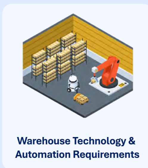
Warehouse Technology & Automation Requirements