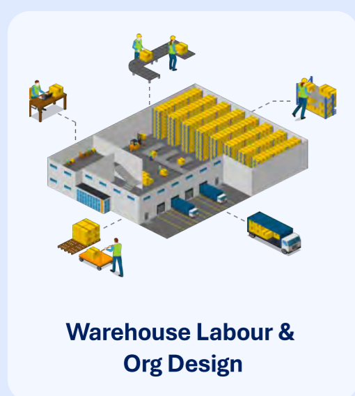
Warehouse Labour & Org Design