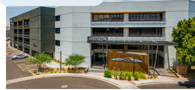
OFFICE – $32M