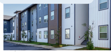
STUDENT HOUSING – $12M