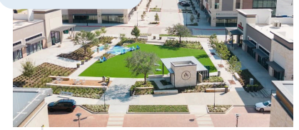
RETAIL – $7M