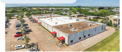
INDUSTRIAL – $26M